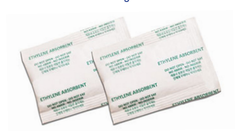
Attach to box closure flap

Attach with staple or tape on the top edge of the Mini-Packet. Do not obstruct air flow through the absorber beads.